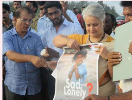
Poster Release by Child Rights Commission