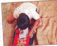
TO LIVE WITH DIGNITY