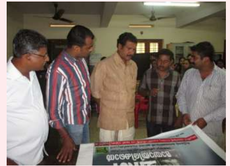
MP visits our center