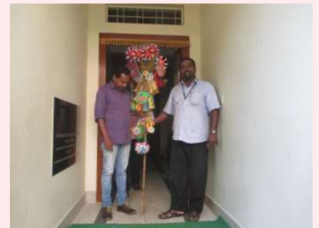
Not for Sale: Evidence to CWC