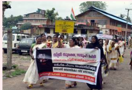
Against Domestic Violence