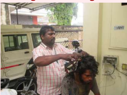
Grooming the Child