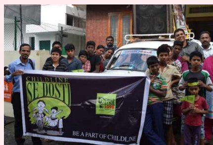
CHILDLINE Se Dosti Week