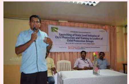
Child Protection Training