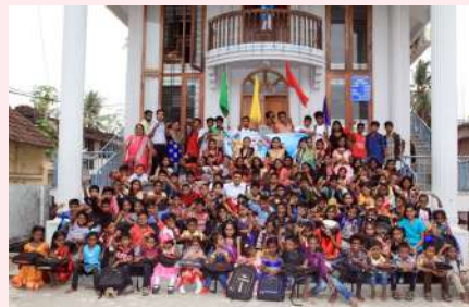
Back to School