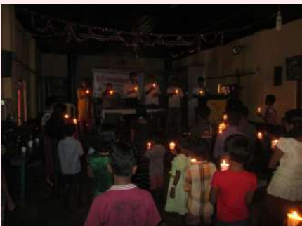
Missing Children Programme