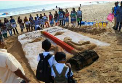
Sand sculpture on Child Labour