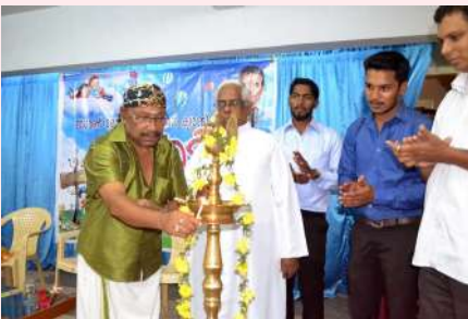
Summer Camp Inauguration